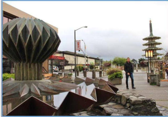
Japan Center, San Francisco

The Japan Center Garage is the hub of San Francisco's Japantown. It was constructed in 1968, and it's divided into two, primary parking facilities: